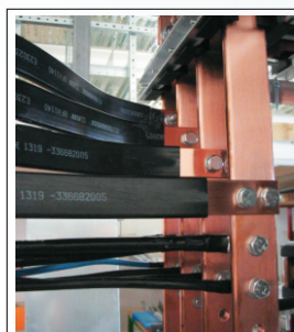
UPS / Stabilizers